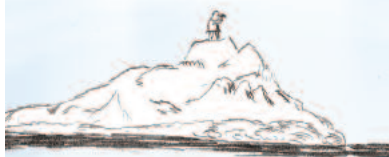
Analghu —Floating pressure ridge of ice.

Here are two illustrations by Vadin Yenan of the over 100 definitions of ice used by Yupik-speaking Eskimos.