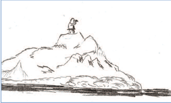
Analghu Floating pressure ice ridge. Ice piled higher than neighboring ones. (Pressure ridges form where two pieces of sea ice push together.)