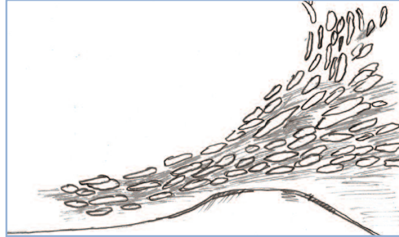
Siingurac Stream of dense ice carried by north or south current or pushed by low tide. Dangerous to walk on.

Illustrations by Vadin Yenani, from the Yupik "Sea Ice Dictionary"